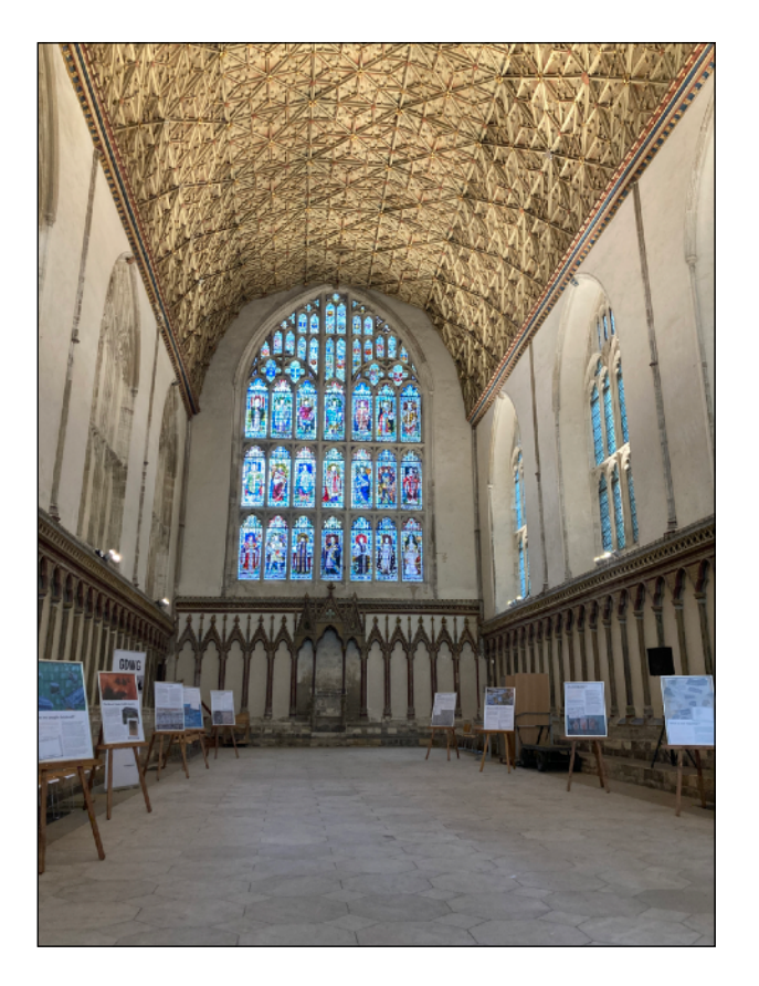
Refugee Tales Walking Inquiry background or findings. People who are experts by experience are part of the team hosting the Exhibition.

Different people wander into the Chapter House; families, tour groups, couples and lone tourists. Many find themselves there for the historical beauty and gaze up at the ceiling and windows, chattering amongst themselves or listening to audio tours on head-sets. Some slowly make their way around the boards in the room, reading every word. We thank people for taking the time to look at the Exhibition and ask what they already know of immigration detention. For most, it is very little or nothing at all. We engage in conversations about the realities of detention, who will find themselves in such a place and the inhumanity that underpins the system. People commend us for bringing their awareness to such an important issue. Most are shocked and ashamed that this is happening in the